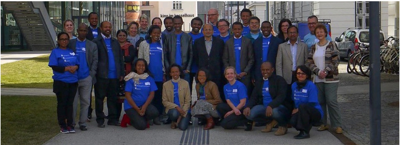
Connecting continents: Team BInUCom with team SES at Danube University Campus, Krems, Austria